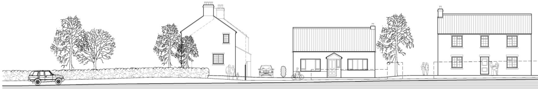
FORKERS LANE STREETSCENE 1:100

Information Notes 1. Foliage locations/heights are omitted to all drawings, clarity. 2. An approved dwelling position indicated by dashed outline.