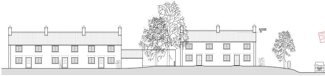
CHAPEL ROAD STREETSCENE 1:100